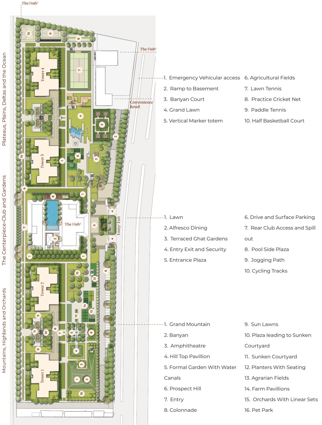
The Hub at Estate 128 admeasures ~ 4273.5 sq. m. and encompasses the club and sports complex (indoor and outdoor)